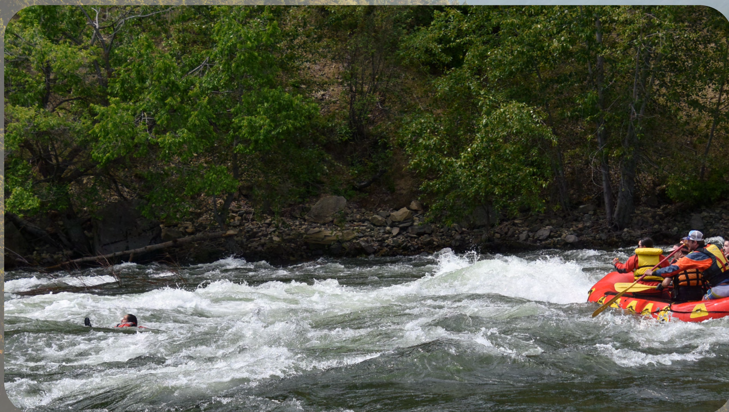
Yoz floating away from the squad (Wenatchee River)