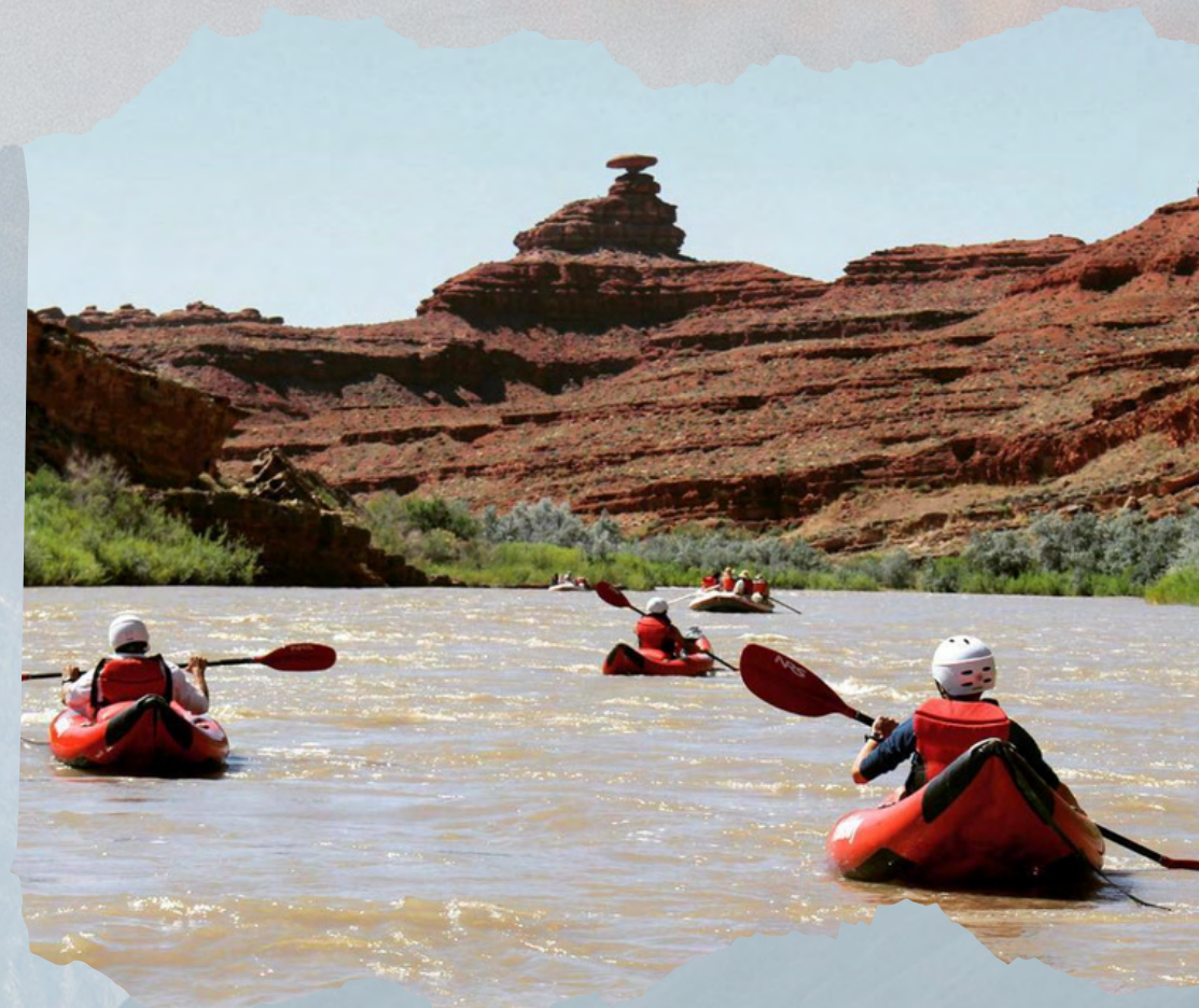
Yoz paddling up to Mexican Hat (San Juan River)